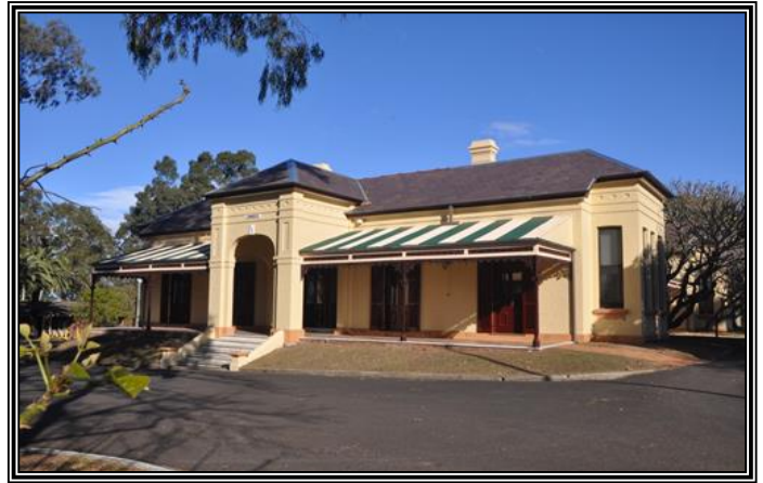
Linnwood – Listed on the NSW State Heritage Register

on Sunday 13 th November 2022 from 11.00am – 4.00pm at 25 Byron Road, Guildford