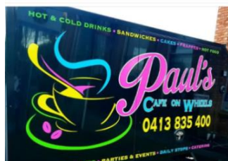
Coffee cart on the front lawn near the BBQ