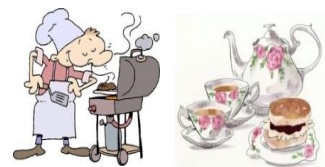
Refreshments Available: Courtesy of The Friends of Linnwood