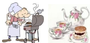
Refreshments Available: Courtesy of The Friends of Linnwood

The Friends of Linnwood now have Eftpos and credit card facilities. Cash still accepted.