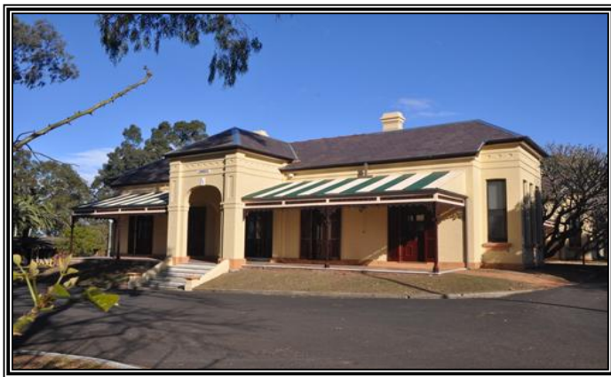
Linnwood – Listed on the NSW State Heritage Register